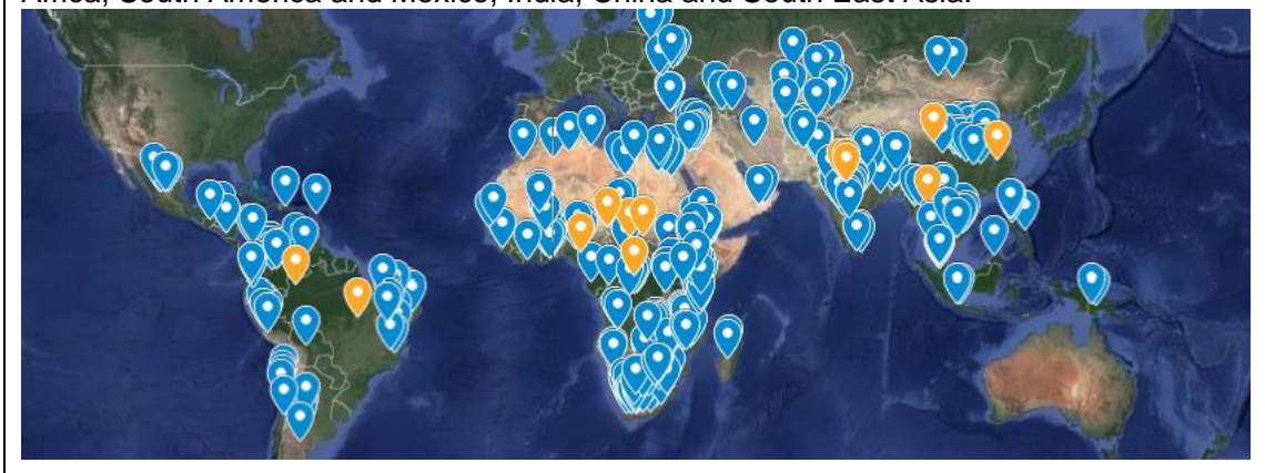
Figure 1; Map showing geographical spread of ODA research at the University of Oxford Funding for ODA research comes from numerous sources, national and international, and mapping synergies between these schemes, and raising awareness of the opportunities and the synergies between them is a key task over the next 36 months. Our comprehensive training and awareness programme will promote ODA research and

The main geographical foci for current funded research partnerships is Sub-Saharan Africa, South America and Mexico, India, China and South East Asia.