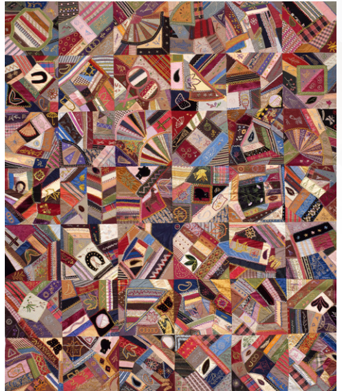
Language Acts and Worldmaking, Languages Memory