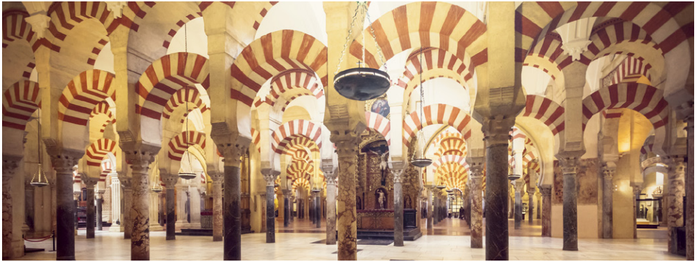
Mezquita de Córdoba

foundational fictions and divisive solidarities of “Us” and “Them”, pitting the “left behind” victims of globalisation against the “cosmopolitan”, liberal elites, on the one hand, and the “welfare draining” immigrant, refugee and asylum seeking “outsiders”, on the other.