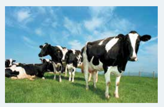
Holstein Friesian dairy cows.

The researchers will ensure that selection for bTB resistance is not detrimental to other desirable