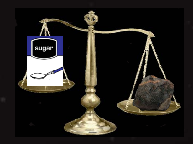
They are heavy for their size