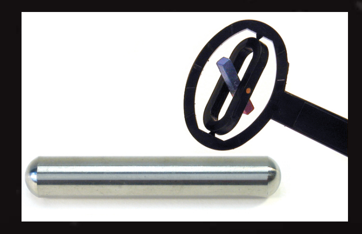
The mini magnet in the magnaprobe will be attracted to it