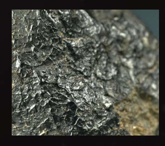
A layer of material that melted as the meteorite cam through the atmosphere

Are Earth material that was melted when a meteorite impacted the Earth. They are bubbly and look like dark glass