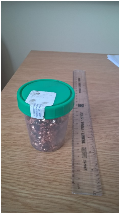
Copper swarf samples