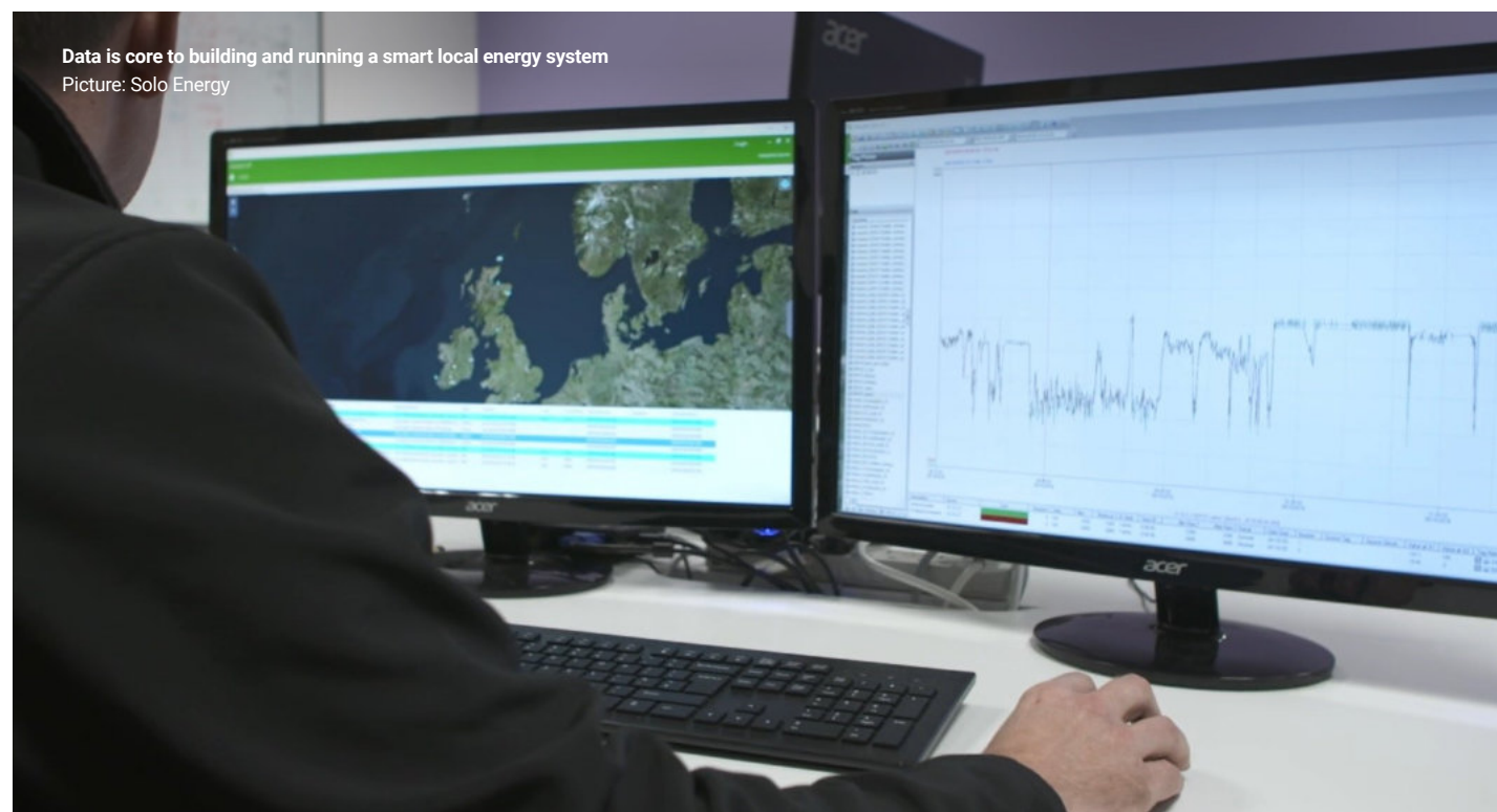
Data is core to building and running a smart local energy system

Developing these skills and the relevant workforce will require some national direction (i.e. creating appropriate training pathways for energy data specialists) with an understanding of local need (i.e. ensuring people can learn these skills and put them into practice in every region and local authority).