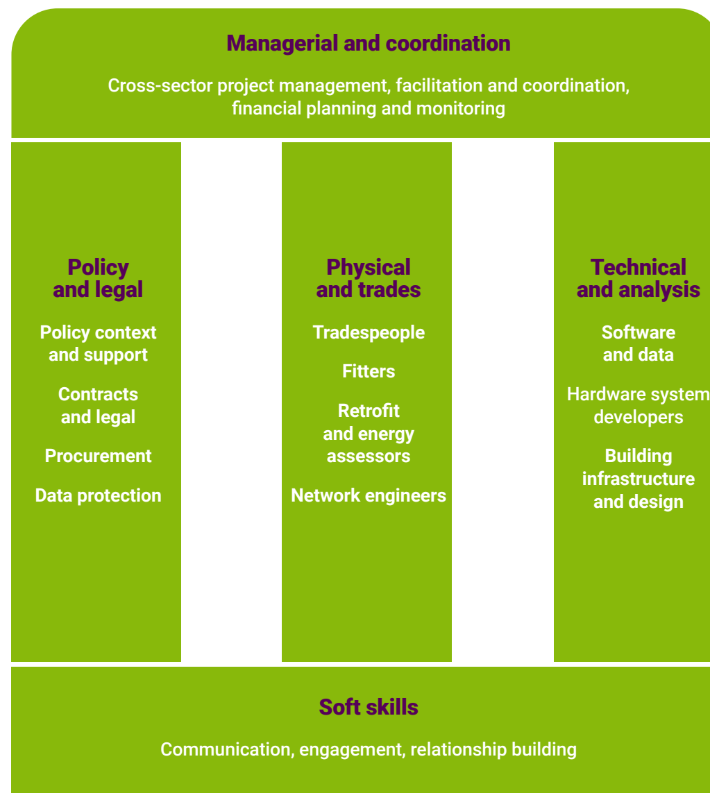
Figure 1. Skills required for integrated local energy systems.

Underpinning all these are soft skills such as relationship-building, convening and communication. Public and citizen engagement is particularly critical, given that the technologies involved are often new and require users to adapt their behaviours and perspectives.