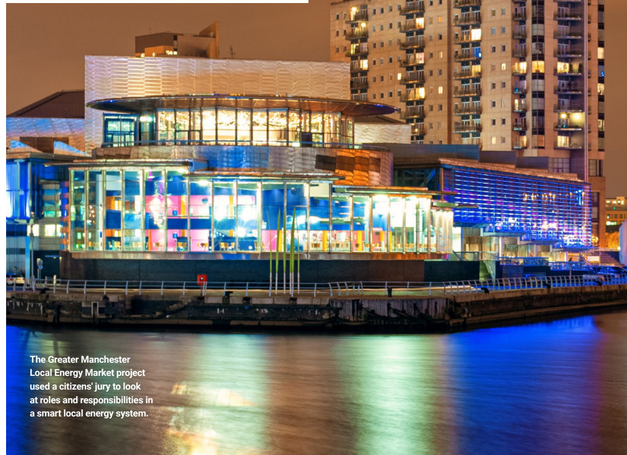
The Greater Manchester Local Energy Market project used a citizens' jury to look at roles and responsibilities in a smart local energy system.