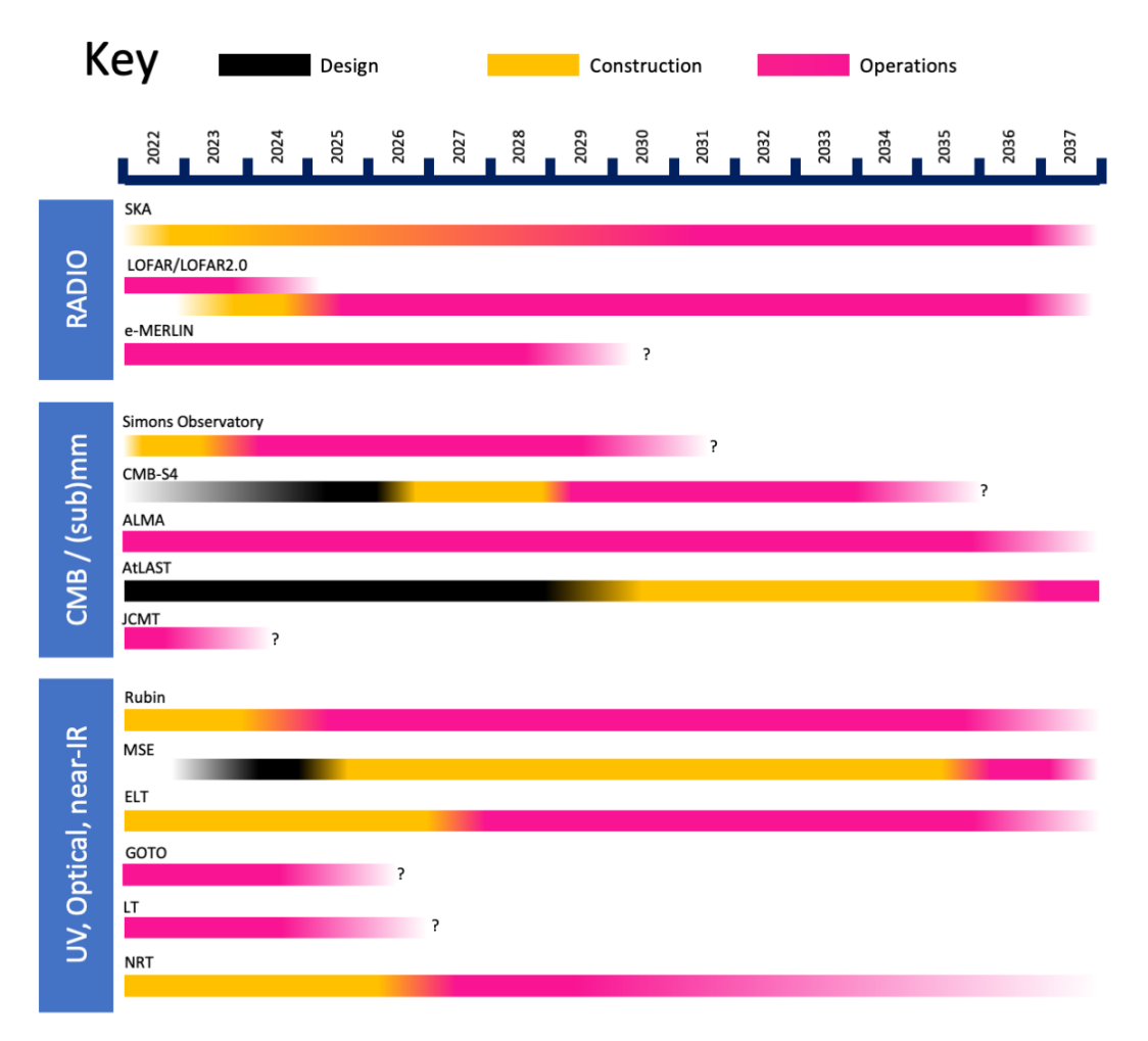
Figure 1: Schematic Gantt chart of a selection of significant facilities<sup>12,13,14,15,16,17,18,19,20,21</sup> featured in the AAP Roadmap. Timescales are indicative only and dependent on a wide variety of factors. Project end dates do not indicate AAP decisions but in many cases reflect current review dates at the time of writing. Only the facilities themselves are shown, and not individual instruments (e.g. WEAVE).